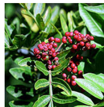
Brazilian pepper forests make poor homes for native wildlife.