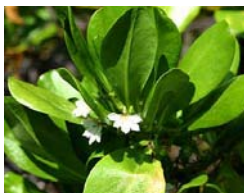
Inkberry forces out native plants that protect our beaches.