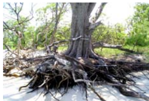
Casuarina trees increase beach erosion.