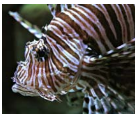
The poisonous Lionfish has no natural predators in the Bahamas.